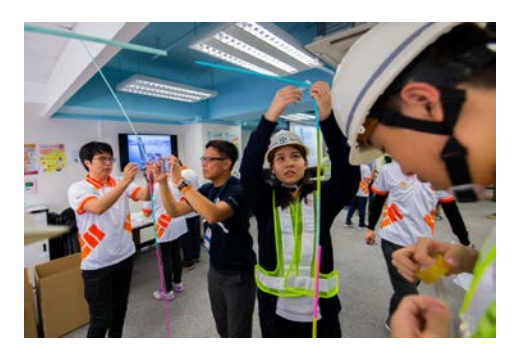
Photo 2: The Group and its non-profit organization partners open up 17 workplaces to give young people a chance to experience different industries. This group visits a construction company to learn more about the importance of industrial safety and about various jobs in the sector.