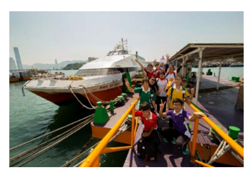
Photo 3: Over 300 young people and corporate volunteers form teams to visit different workplaces and get a taste of various jobs. This group of participants experiences the job of corporate communications by directing a civil education video for New World First Ferry Services.